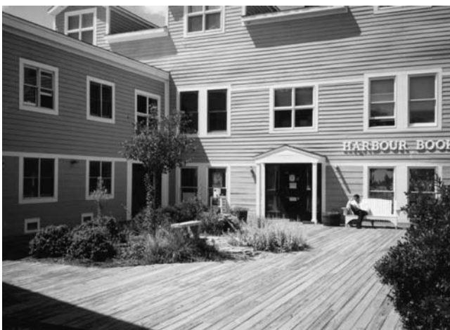
This small public plaza provides an interesting internal focus for a multi-building site. The wooden decking and traditional building materials complement each other in scale and texture.