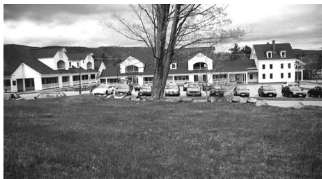
Grade changes and a stone wall were used to screen the parking lot of this new commercial development.