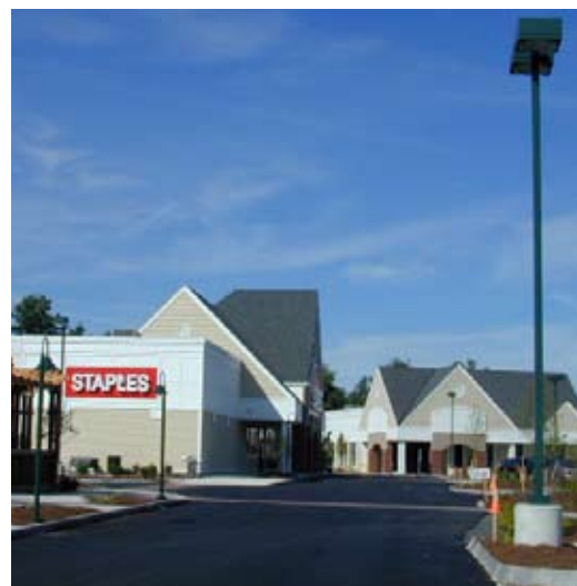
Similar roof pitches, pedestrian use areas, and traditional building materials help unify this multi-building site.