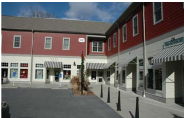
A new mixed use building with parking and entrances in the rear.