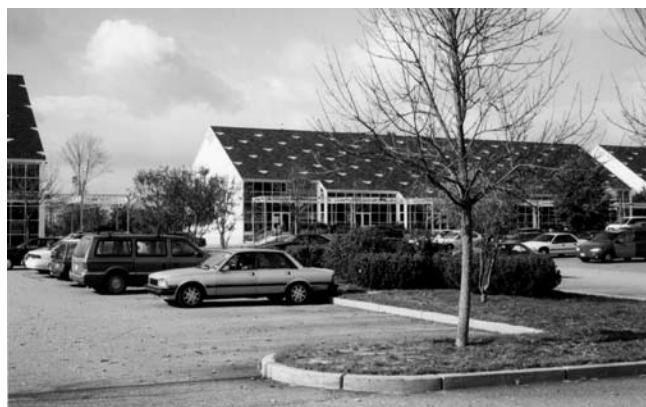
Precast concrete is a lower cost alternative to granite.