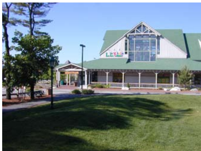
Informal lawn areas provide welcome visual relief and opportunities for programmed activities.

Building Orientation. All buildings in MBD's should be laid out to create usable, attractive pedestrian spaces, preserve significant site features, and minimize the view of parking areas.