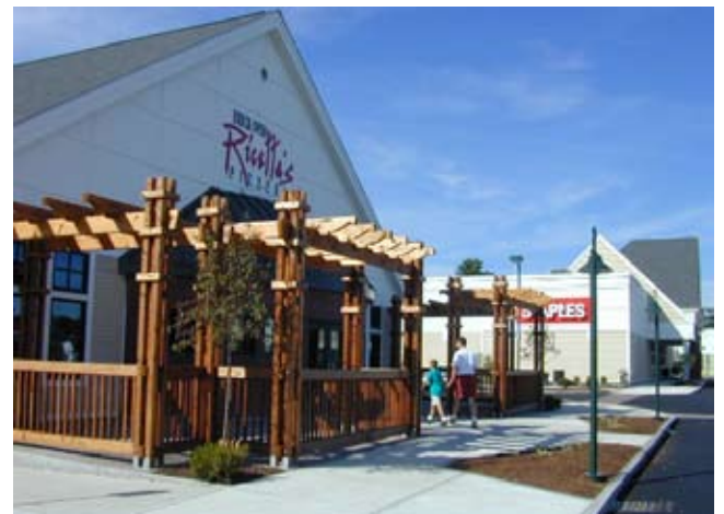
An informal dining area in front of a restaurant provides shade and enclosure in an attractive setting.