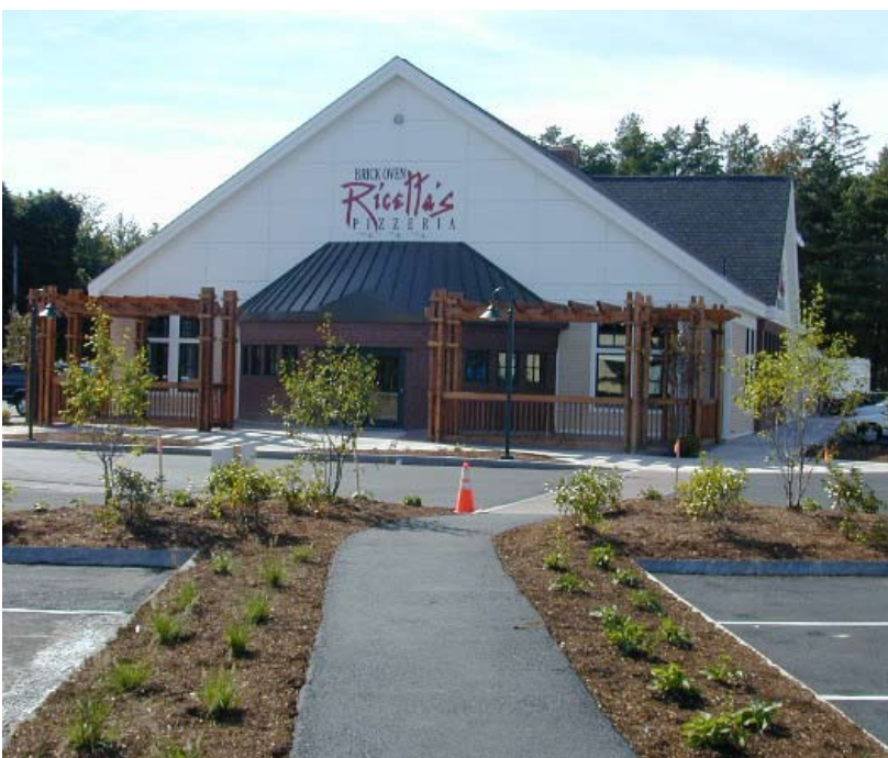
An internal walkway oriented toward the main entry of a restaurant in a multiple building development. The planting strips with ornamental grasses and perennials separate the pathway from overhanging bumpers.