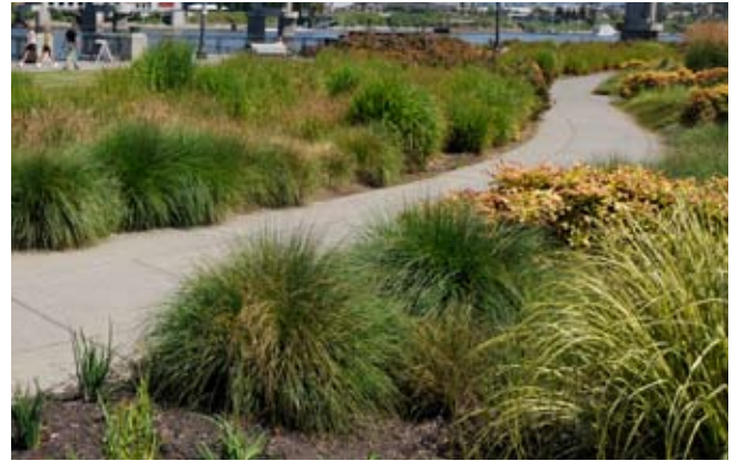
Native grasses create an attractive vegetated buffer.