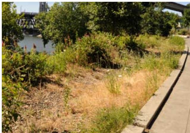
A vegetated swale next to a walkway absorbs runoff from the paved surface and filters stormwater.