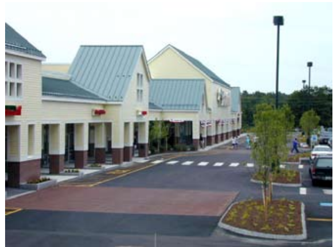
These wide parking lot islands will provide ample room for tree growth.

Snow Storage. Provide space for snow storage in the design of parking areas. The areas used for snow should avoid landscaping, utilities, and signage. Site storage areas to avoid problems with visibility, drainage, or icing during winter months.