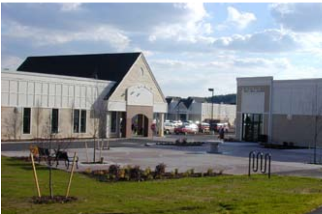
This MBD is unified by a common architectural style and coordinated landscaping, lighting, and outdoor spaces.