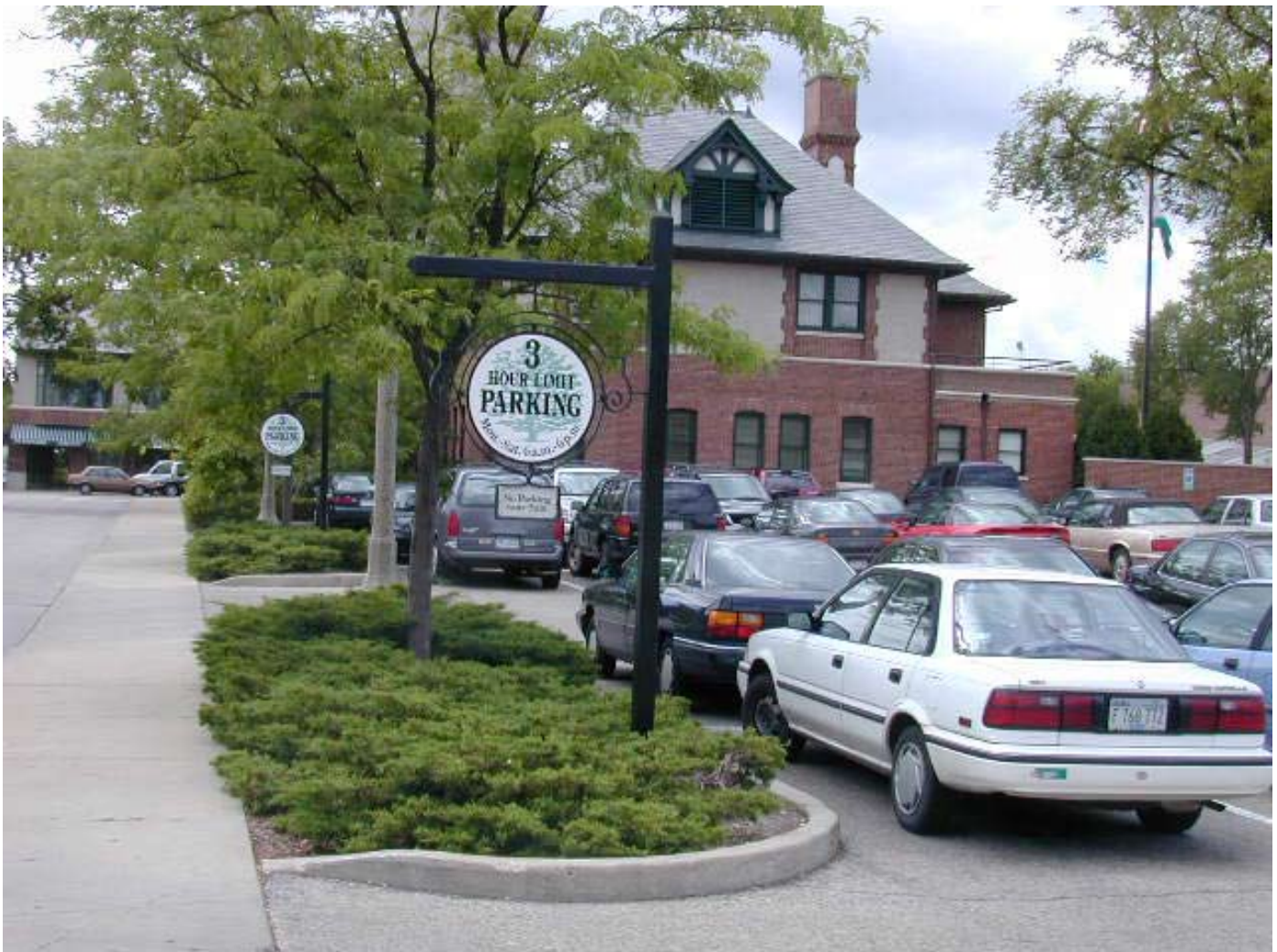
An attractively landscaped parking lot that is a positive asset to the surrounding commercial area.