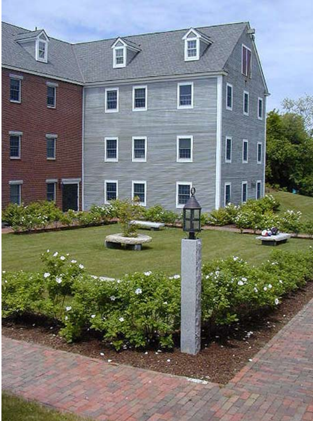
A semi-public garden that provides a place for people to sit, relax, and socialize. The detailing echoes the traditional materials found in nearby buildings.