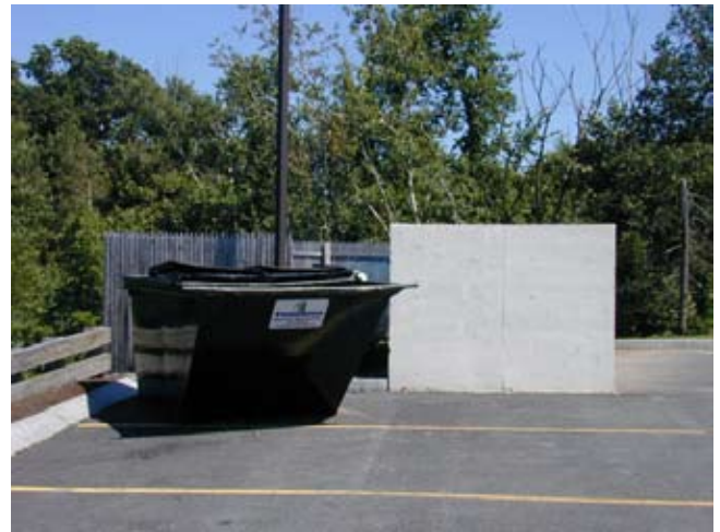
This trash enclosure was not properly sized to handle the dumpster needed for the facility.