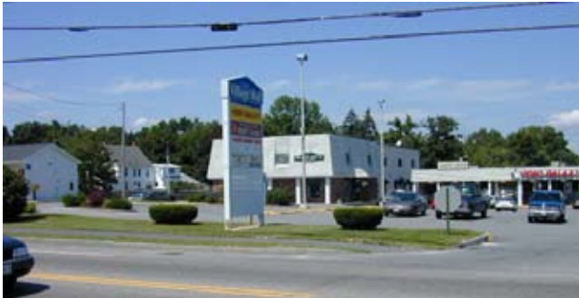
Typical commercial development lacking in scale, landscaping and pedestrian amenity. Parking lots are dominant visual elements.

Good site planning results in an attractive, safe, and economically viable relationship between buildings, parking, signage, lighting, landscape, and the surrounding environment. Site plans should minimize the negative visual effects of unbroken parking lots, feature high-quality landscaping, accommodate pedestrian movement, and encourage appropriate connections to adjacent properties.