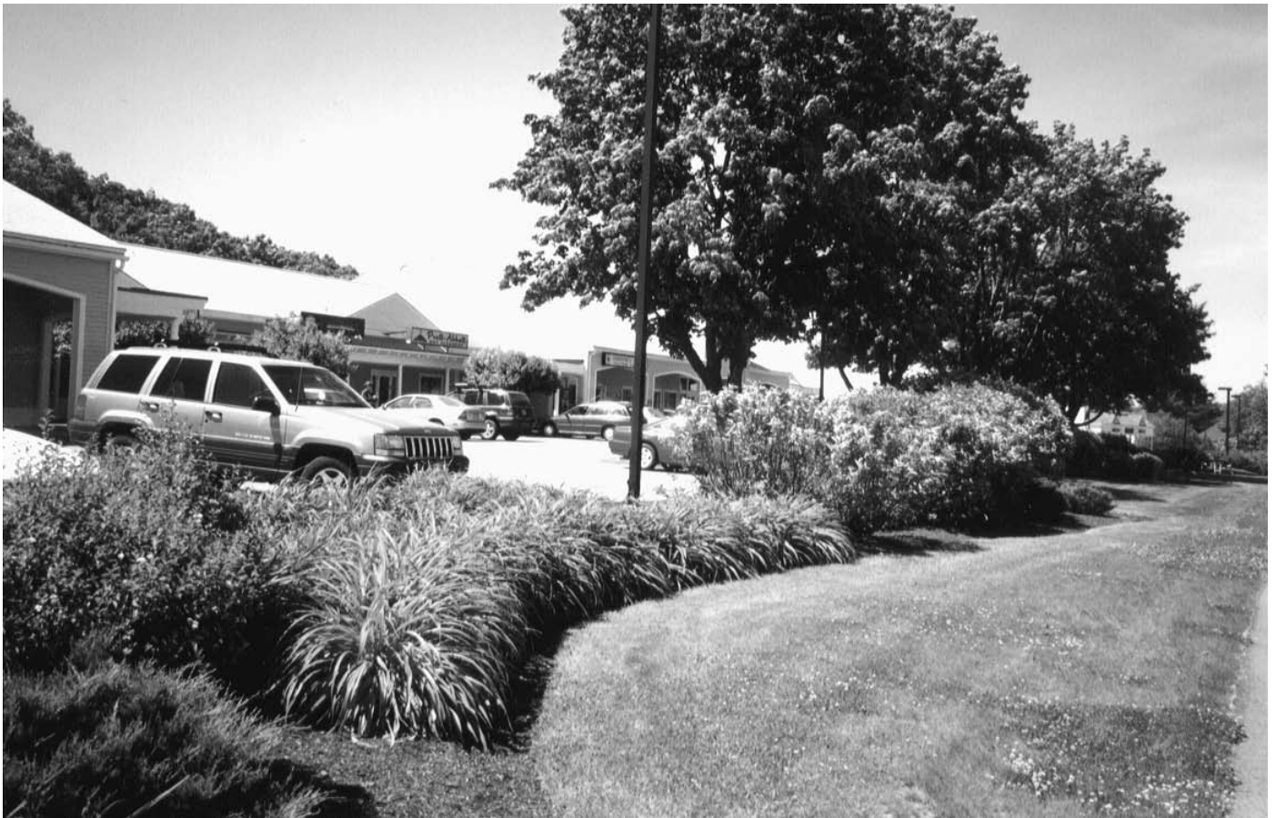
Mass plantings can be used to separate pedestrian paths from parking areas and add continuity to the site plan. Existing trees were preserved to shade the parking area and add scale to the building. .