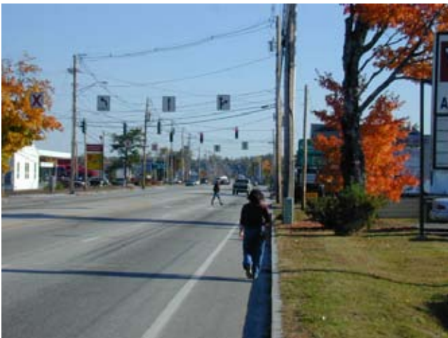
The vision for Raymond's commercial district calls for sidewalks along all public roadways to encourage safe pedestrian movement.

Coordination with Site Plan. Plan sidewalks to avoid conflicts with landscaping, utilities, grading, drainage structures, signs, and other elements on the site plan. Walkways should be designed to facilitate