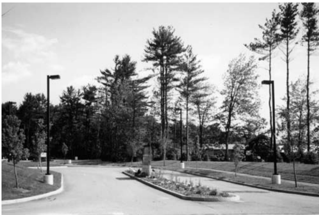
This curbed, landscaped island divides entering and exiting traffic. The identification sign is located away from the intersection to avoid interfering with the motorists' line of sight.