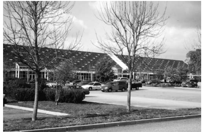
Landscaped islands help to ensure the long-term health of parking lot plantings. The islands help break down the scale of the lot so it does not dominate the building.

Circulation Design. Circulation patterns for parking lots with more than 40 spaces should be designed by a professional qualified to perform traffic analysis to meet the Land Use Ordinances. The Planning Board may require a professional qualified to perform traffic analysis for smaller lots where there are particular public safety issues.