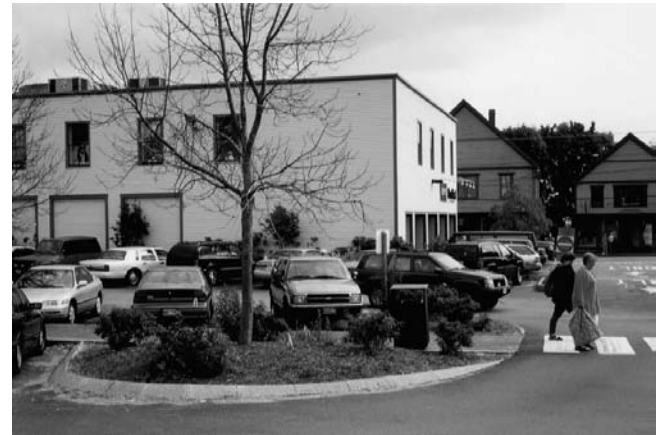
A raised walkway through this parking lot provides a safe, attractive pedestrian route. Reflective paint used in the crosswalk marks the route in a highly visible manner.