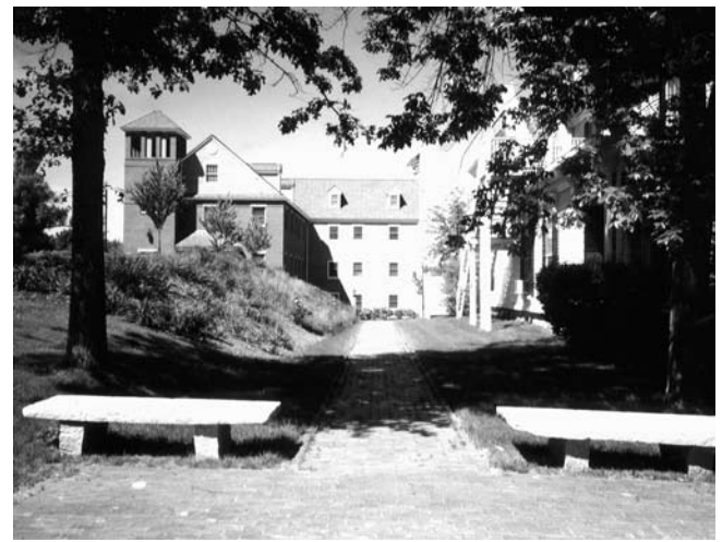
Simple sidewalk seating areas frame a significant view and provide a rest area for pedestrians. The steep bank on the left has been planted with perennials for a colorful, low-maintenance groundcover.