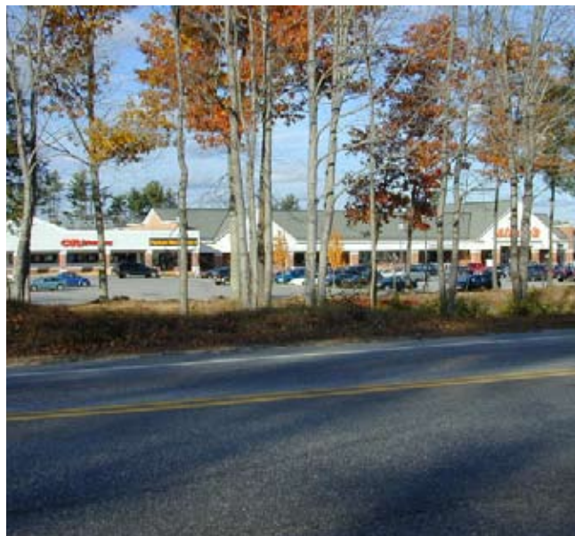
This stand of trees creates an effective visual buffer between the road and the plaza parking lot.

Maintenance. Maintain buffers to provide the level of screening required by the Planning Board at the time of Site Plan approval. If plantings die, suffer from lack of maintenance, or grow to a point where they no longer serve as effective buffers, they should be replaced or reinforced with additional plantings to meet the intent of the approved plan.