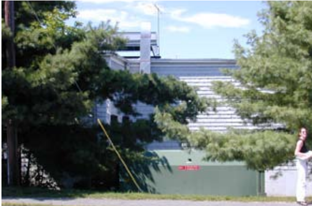
This service area is effectively buffered by grade change and existing evergreen trees.

Recycling Facilities. The installation and use of recycling bins, in addition to dumpsters, is encouraged. Bins should be screened in a manner similar to other service areas. Dumpsters and recycling areas should be consolidated wherever practical.