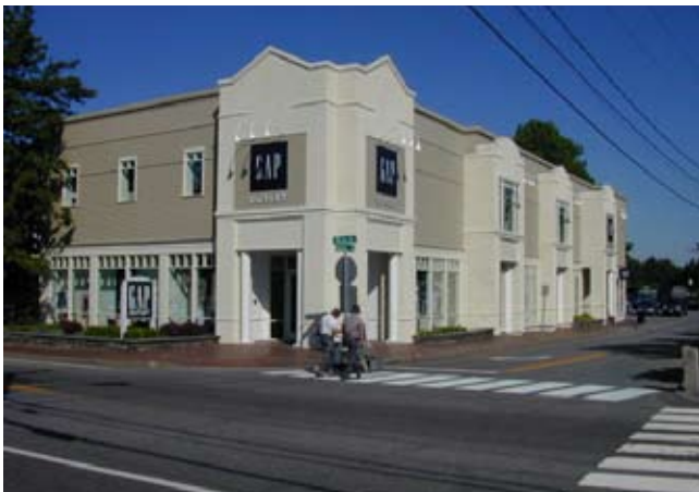
This new corner building provides both streets with attractive facades. Setbacks allow room for sitting areas.

Visibility. Minimum safe sight distance, as defined under local ordinance and, in cases where required, as