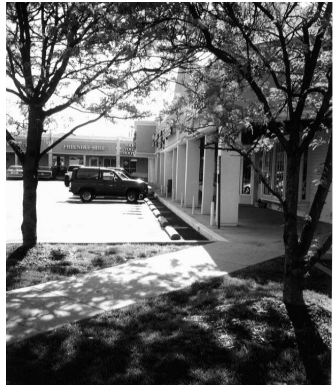
An internal walkway that is an integral part of the site development plan, coordinated with building placement, landscaping, and lighting.

Walkways Adjacent to Buildings. For commercial structures with two or more units, provide a paved walkway along the full length of facades with customer entrance and abutting parking areas. Locate these walks at least five feet from the facade to provide room for planting beds.