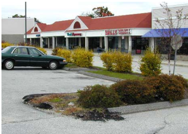
While asphalt curbing is inexpensive to install, it is very prone to snowplow damage.