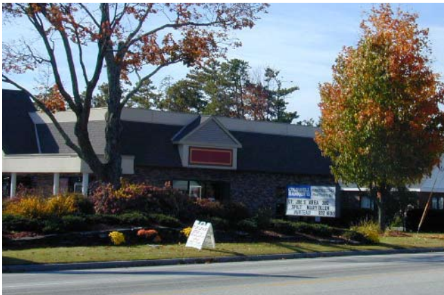
New development with parking on the side, extensive landscaping, preserved trees, and building relatively near the street,