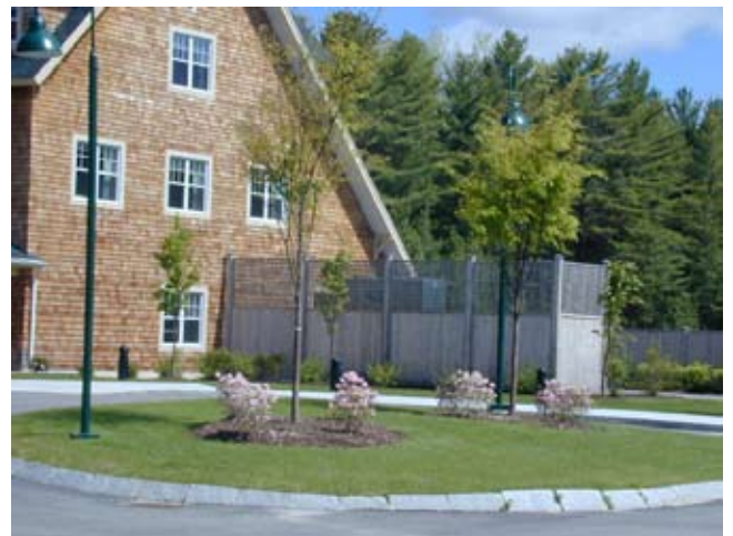
Mechanical units for senior housing are hidden behind a fence with opaque and translucent panels.