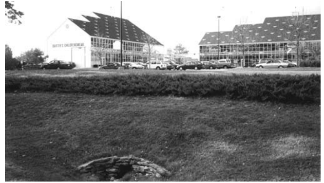
Motorists driving past this shopping center only see the low juniper hedge, unaware of the detention basin on the far side. Hand-placed stonework protects the end of the culvert.