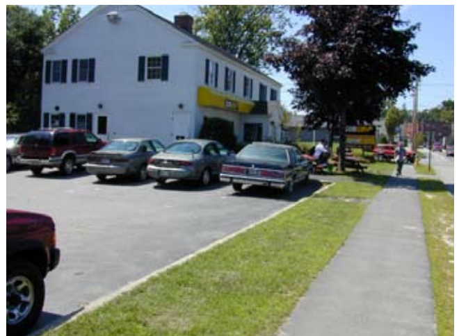
Dead-end parking lots are difficult to exit, especially when the lot is full.

Shared Parking. Shared parking is strongly encouraged in situations particularly where abutting businesses have differing hours of peak parking demand. Cross easements will be required to allow the use of shared parking in these instances.