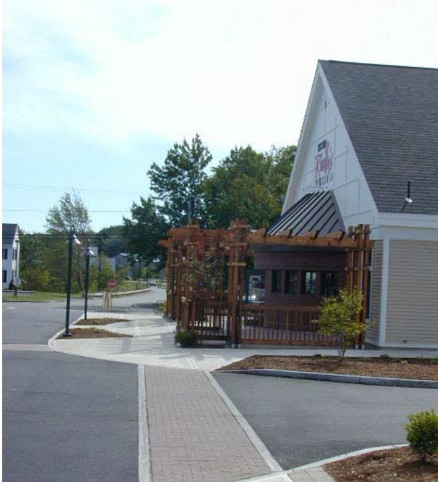
Concrete pavers create a permanent crosswalk that affords good visibility and contrasting surface texture.