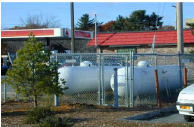
Chain link fence provides security, but is too transparent to provide any visual screening.