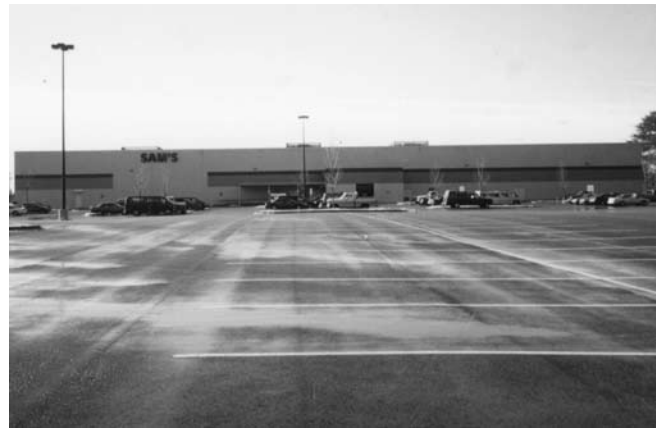
Landscaped islands should have been used here to provide scale, reinforce internal circulation routes, and lead pedestrians to the entrance.