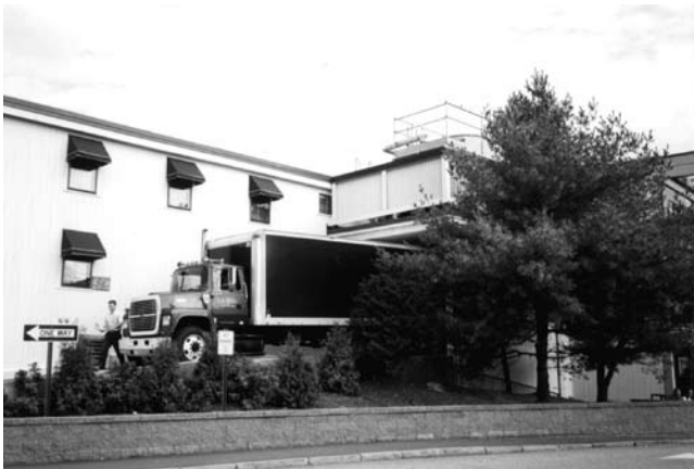
This service area is effectively integrated into the side of the building and well screened by an evergreen buffer.