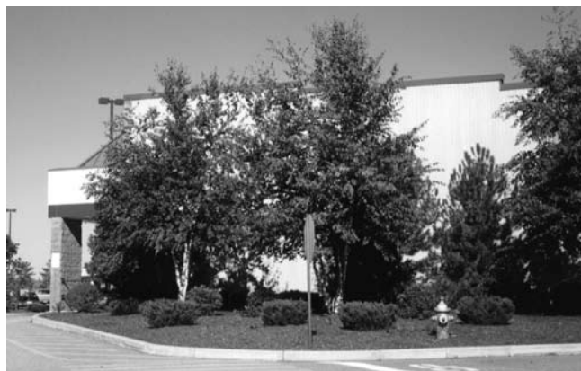
Buffer plantings can achieve a natural look through the use of a variety of native plant materials..