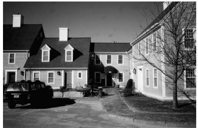
This office complex offers a variety of exterior spaces and relates well to surrounding residential areas through attention to design, scale, and details.

Outdoor Sales and Storage. Areas designated for outdoor sales, storage, or service should be designed as an integral part of the site and architectural plan.