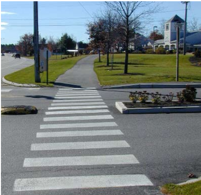
An island provides a refuge zone for pedestrians crossing this wide driveway. Permanent crosswalks should have been used to minimize annual maintenance.

Location of Walkways. Locate internal walkways in areas where motorists can anticipate pedestrians and react accordingly. Design walkways to give the pedestrian a full view of oncoming vehicles, with minimal interference from trees, shrubs, and parked cars. Walkways should avoid drive-through lanes, access and service drives, and other high-traffic routes. Locate traffic control signs, light fixtures, trees, or other potential obstacles far enough from walkways to prevent interference with pedestrian movement.