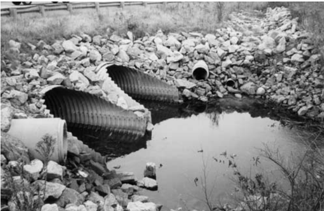
Rip-rap is often necessary to control erosion and stabilize slopes. In highly visible areas, a more refined appearance – accomplished through the use of hand-placed stone and/or ground cover – is necessary to avoid situations such as this.