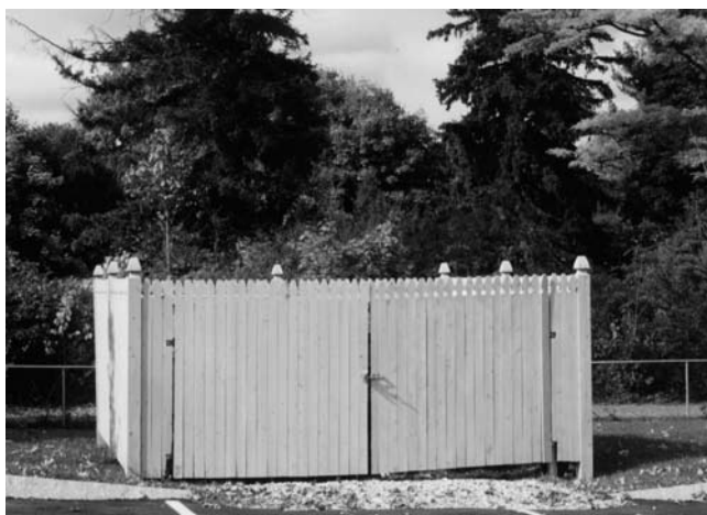
A typical trash enclosure. Its appearance could be improved by plantings along its sides, detailing to match nearby buildings, reinforcing the gates, and staining a dark color.