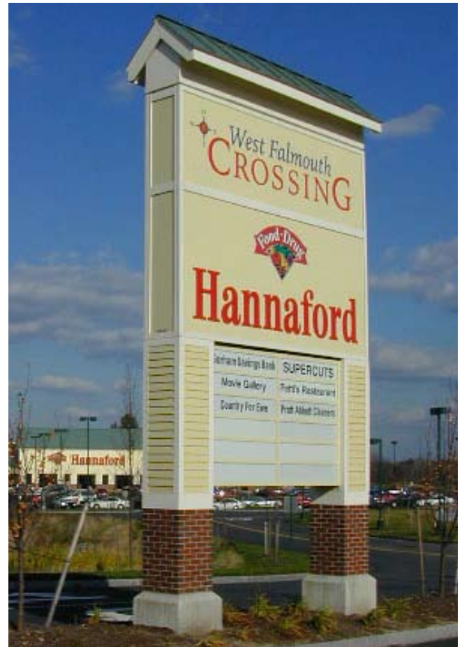
Signage for multi-building development can reinforce the aesthetics of the commercial district by careful attention to detailing and materials.