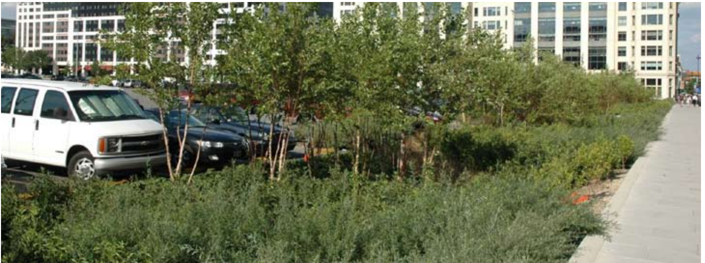
An infiltration area next to a parking lot provides an attractive and functional way to deal with on-site stormwater.