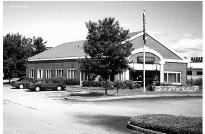
A site plan for this bank responds to specific conditions on the property, creating functional, human-scaled spaces.