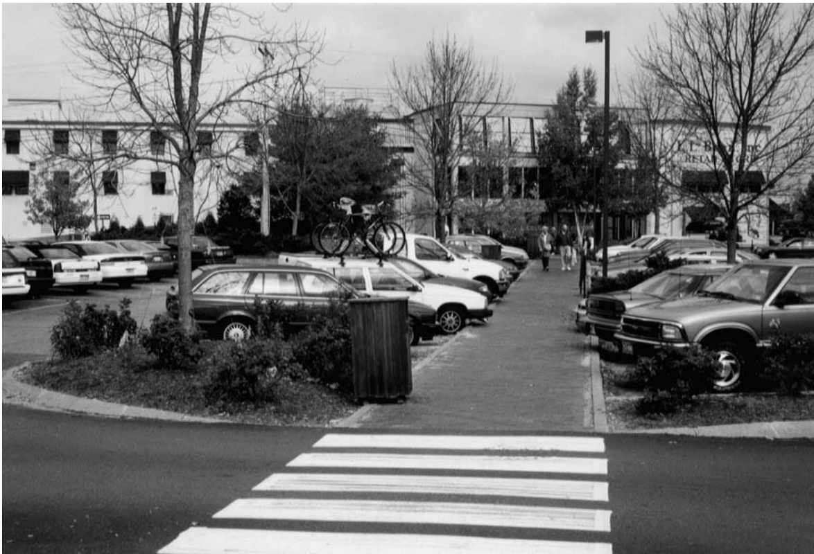
A wide walkway that provides a well marked, attractive pathway to the main entrance. Separated walkways are more desirable than systems that end behind parked cars

Width. Sidewalks within the public ROW should have a minimum width of 4', although six feet or greater may be desirable to accommodate pedestrians, bicyclists, and wheelchair users. Walkways through parking lots should be a minimum of five feet wide to allow two people to pass comfortably. Additional width may be necessary in certain conditions, e.g., where shopping carts may be used, where heavy pedestrian traffic is anticipated, or where cars overhang the walkway.