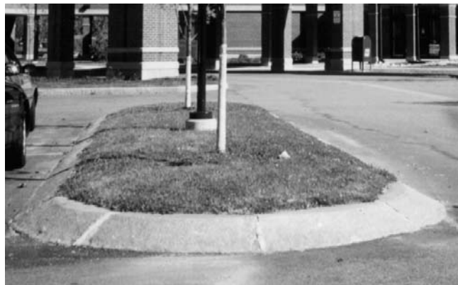
Sloped granite curbing can facilitate turning movements and snow plowing.