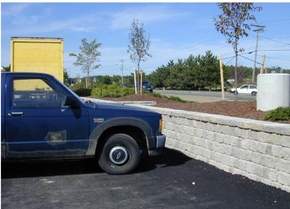
Parked cars are effectively screened by a low concrete block wall and ornamental plantings.