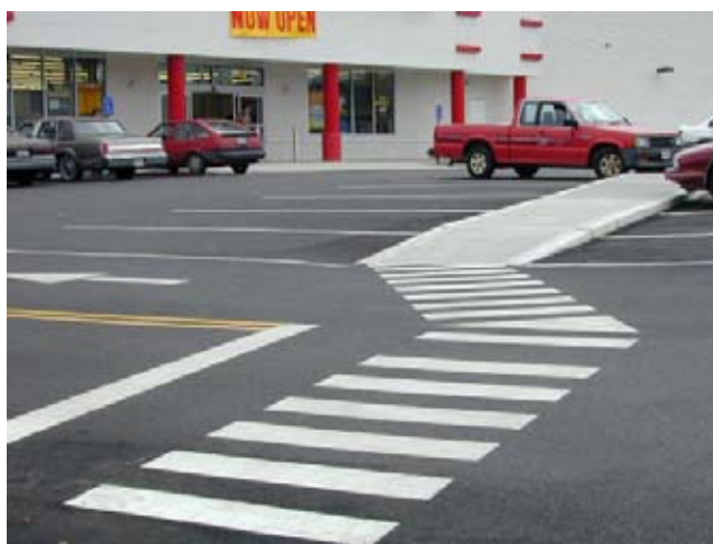
A raised walkway that provides a high level of contrast with the surrounding parking lot. However, the width of the walk is compromised by the overhang of the cars, making pedestrian movement difficult.

Location of Walkways. Locate internal walkways in areas where motorists can anticipate pedestrians and react accordingly. Design walkways to give the pedestrian a full view of oncoming vehicles, with minimal interference from trees, shrubs, and parked cars. Walkways should avoid drive-through lanes, access and service drives, and other high-traffic routes. Locate traffic control signs, light fixtures, trees, or other potential obstacles far enough from walkways to prevent interference with pedestrian movement.