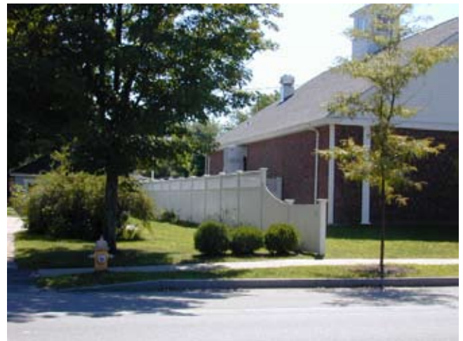
A variable height fence used to provide visual separation between a convenience store and its residential neighbor. Note exterior storage behind fencing.