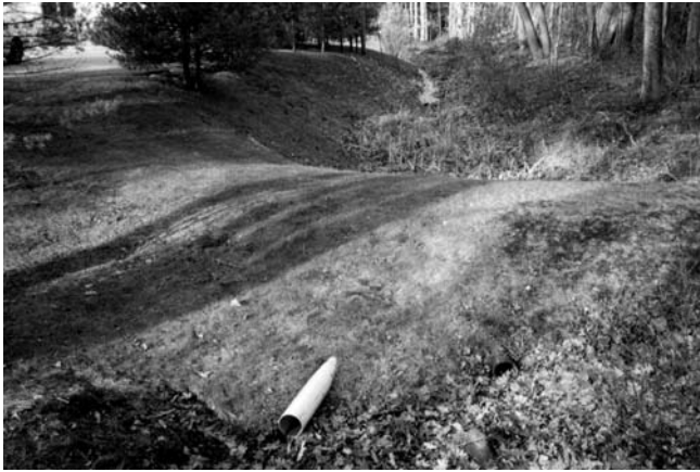
This stormwater management facility has been designed to blend into the landscape through transitional grading. The outfall pipe should have been integrated into the design.