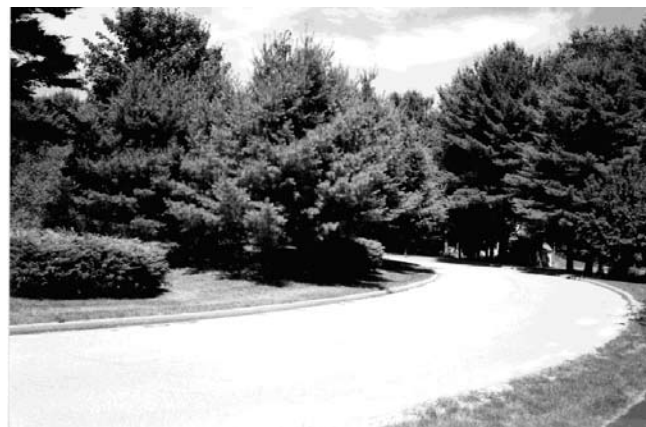
A 6-8' high earth berm, planted with evergreen trees and shrubs, creates an effective screen to separate an access drive from residential properties.