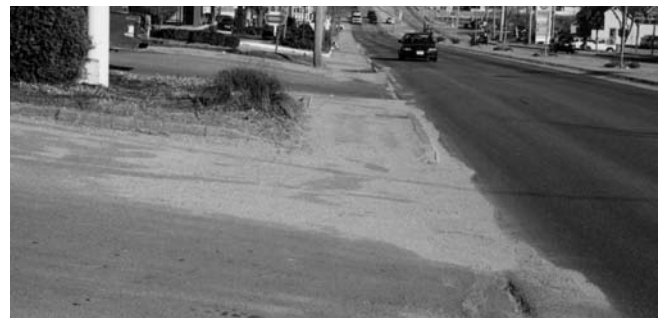
The number of curb cuts and the relatively steep cross-slopes on sidewalks create an unsafe/uninviting environment for the pedestrian and wheelchair user.