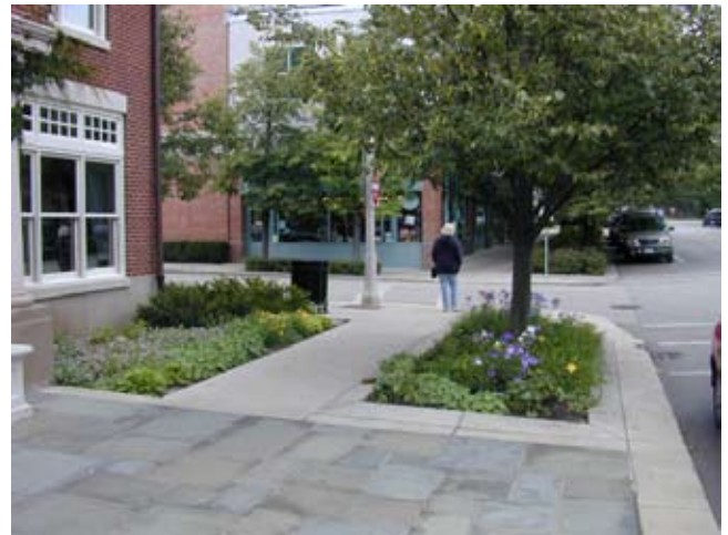
Esplanades can be grass or planted with annuals, perennials, grasses, or shrubs for seasonal color.

snow removal. Walkways in parking lots should be aligned with the main entry or a focal point on the building to assist in wayfinding.