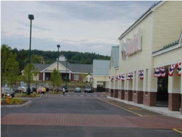
Buildings in this multi-building development are oriented to a grid pattern, with strong pedestrian circulation.