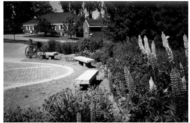
A small garden and sitting area that enriches a multi-purpose pathway. Careful consideration has been given to the materials, landscaping, and furnishings to create a durable, attractive public landscape.