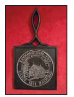
Raymondtown Trivet $5.00