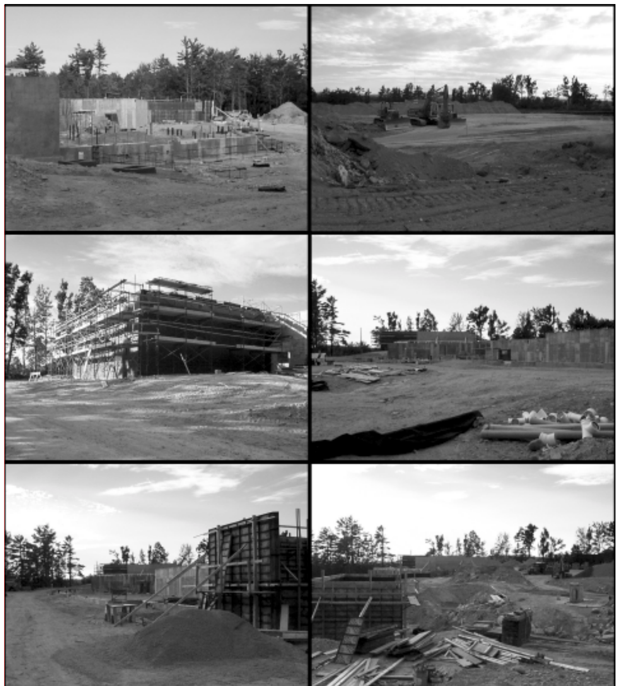
The New Raymond Elementary School As Of July 21, 1999

PLEASE NOTE: It is our policy when dropping off there is an adult present at the bus stop.