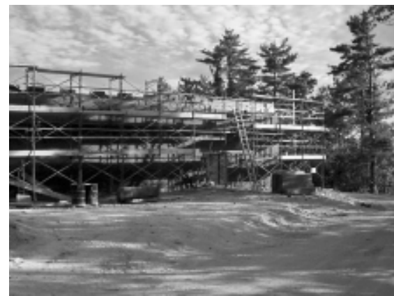
The New Raymond Elementary School As Of July 21, 1999

PROP Food Distribution by Raymond Food Pantry at Raymond Town Hall will be Tuesdays from 4:00 PM to 6:00 PM and Fridays from 10:00 AM to 12:00 noon.