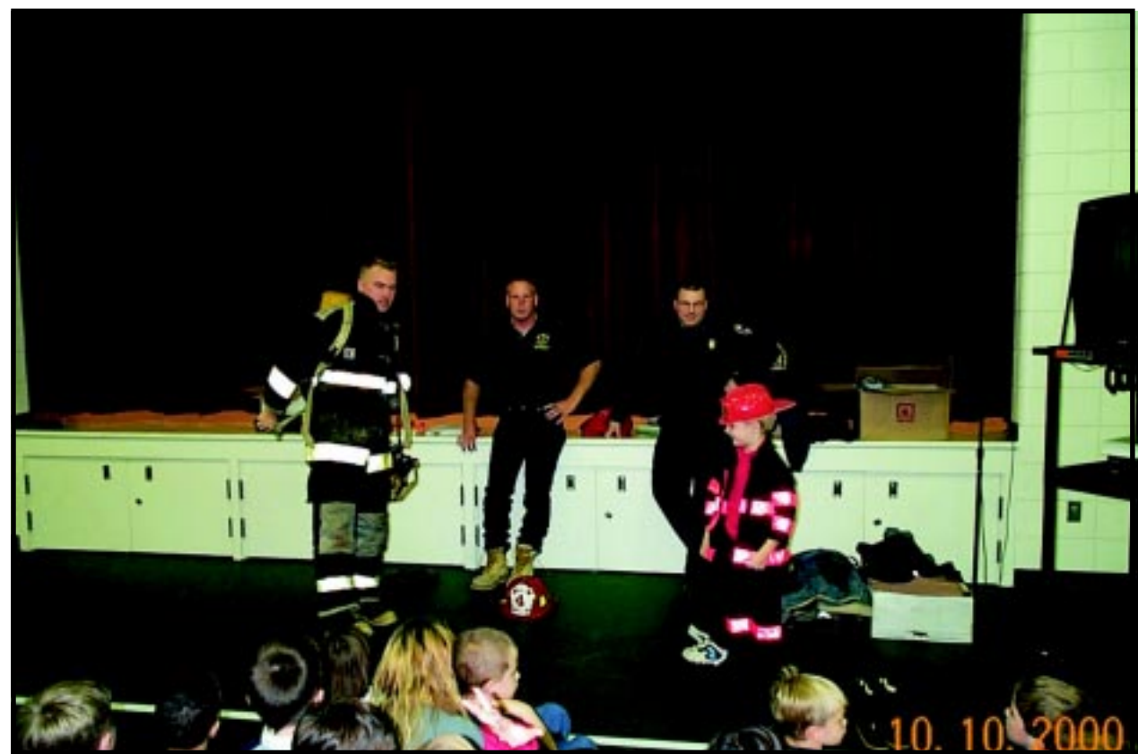
The Raymond Fire Department makes a visit to Raymond Elementary School

The doors are always open, but the rules must never be broken.