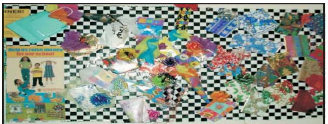
The Innisbrook bulletin board at Raymond Elementary School