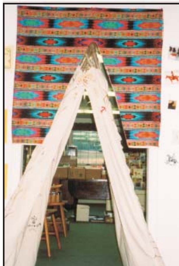
Teepee by the Troop 800 Boy Scouts