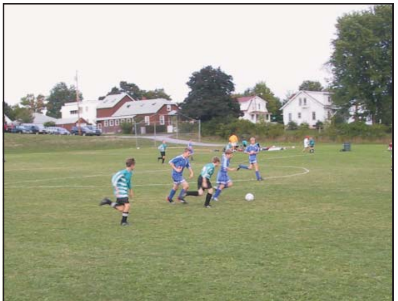
The JSMS boys soccer team is having a great season with a 2-1-2 record.