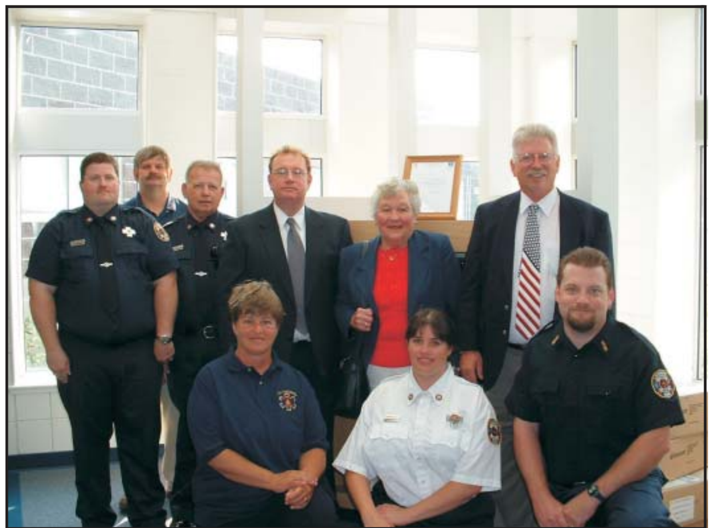
Town officials and emergency response staff members attended the 9-11 memorial ceremonies at the Raymond Schools.