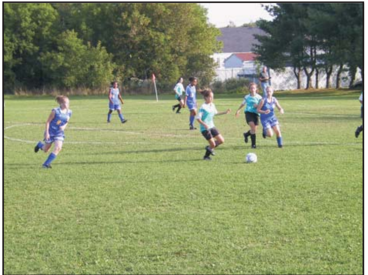
The JSMS girls soccer team playing Holy Cross in Lewiston, as they win their fourth game this season. They have a 4-0-0 record.

Our long term goal is have Phase Two complete in time for Raymond's Bicentennial celebration next summer.