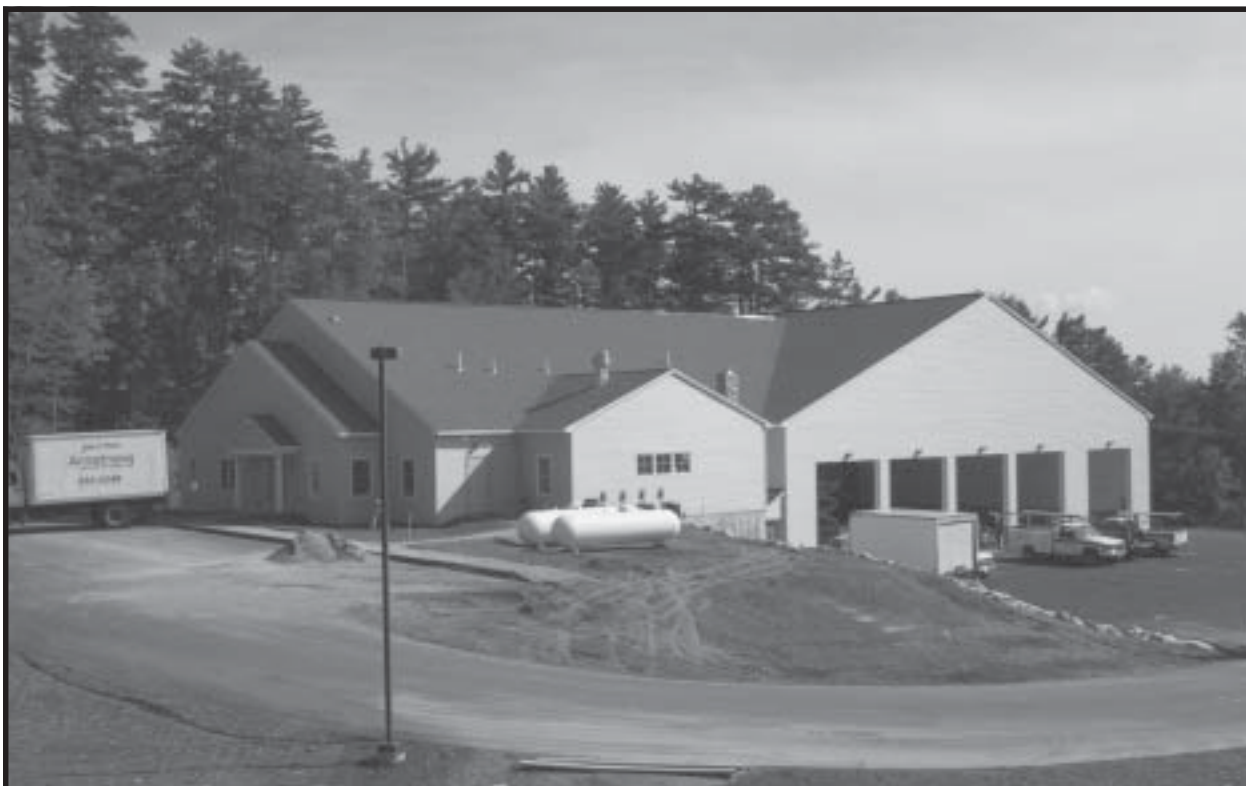
The new fire station nears completion.

We would like to congratulate parents for wading through the volumes of paperwork sent home during the first month of school, and for updating and returning forms to the office. Please be sure to keep us updated on any changes to health, home, or work information throughout the school year, so that our records are accurate.