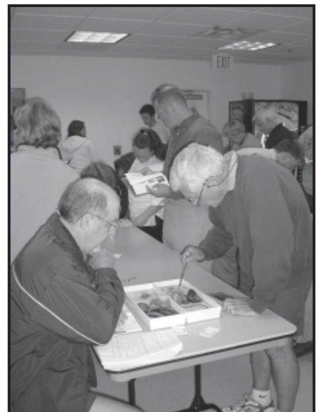
June 22nd Plant Identification Workshop

Join friends and neighbors for a fun, educational boat ride around Thomas Pond. See the shoreline and learn how to enhance your property. Learn how to protect the lake while beautifying your property and increasing the value of your lot. This educational cruise is part of the Thomas Pond Conservation Project and will showcase many of the completed projects around the lake. One boat will leave from the Common Beach on Watkins Shore Road, and the other boat will leave from 79 Thomas Pond Terrace. To register call Betty Williams at the Cumberland County Soil and Water Conservation District at 856-2777 or e-mail betty-williams@me.nacdn.org .