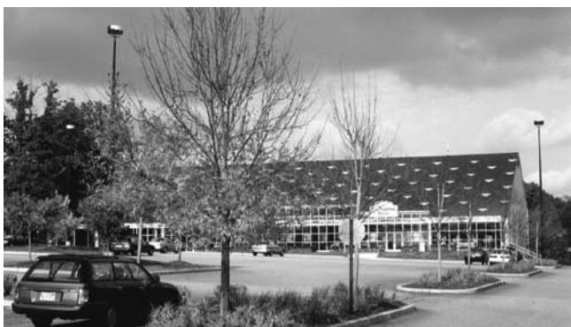
Parking lot islands should be large enough for trees to achieve full maturity and to prevent damage from car doors and snowplows.