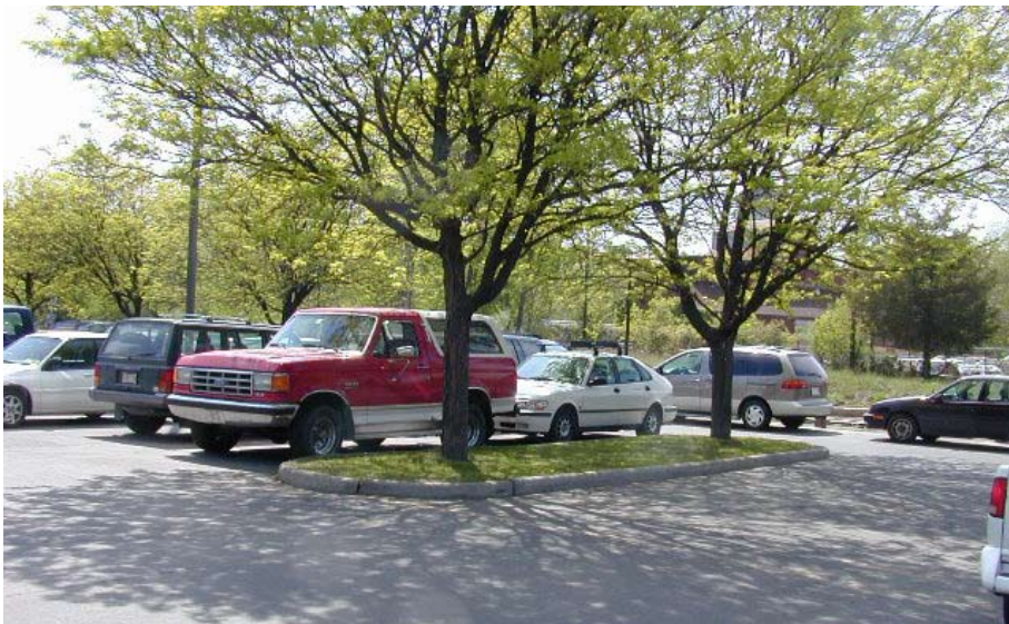
Trees in this parking lot have been given an adequate amount of room for their root systems to grow. The lower branches have been pruned above eye height.