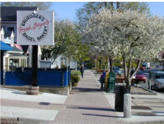
Ornamental trees can be an effective way to give scale to the street. Trees should be pruned to a minimum of 8' above the walk.