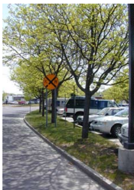
Parking lot islands provide an opportunity to use a variety of tree and plant species to break up the mass of pavement and introduce interesting textures.