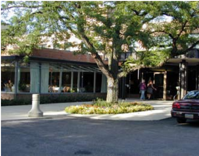
By preserving this specimen tree, the owner maintained visual interest, provided shade, and retained site character.