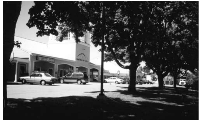
These mature maples were carefully saved during the development of this shopping area. The trees add character, visual interest, and shade.

Pedestrian Movement. The lower branches of trees planted near pathways and sidewalks should be at least eight feet above the surrounding grade and five feet from the edge of the pavement to minimize interference with pedestrian movement throughout the year.