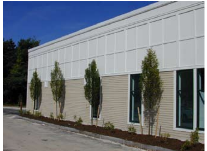
Upright forms of tree species were selected for this tight location next to a building wall.