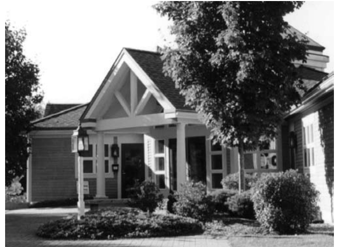
An informal grouping of trees, shrubs, groundcovers, and trees emphasize the front entrance of this office building.