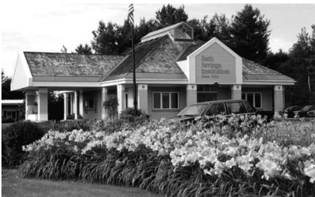
Masses of daylilies make a bright, colorful statement in front of this bank. Additional drifts of similar plantings in the commercial area would create a memorable effect.

Accent Plantings. The installation of special planting beds is encouraged to complement the plantings along the pedestrian path and add year-round visual interest. These could include daylily beds, butterfly gardens, bog gardens, fragrant gardens, shade gardens, yellow foliage gardens, early blooming gardens, texture gardens, etc.