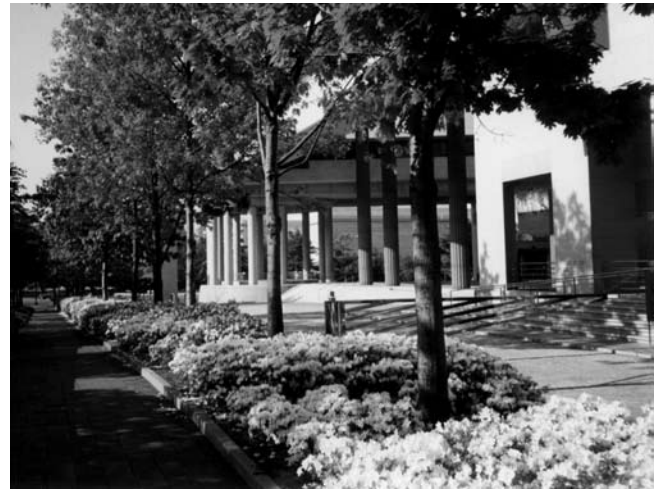
Trees effectively help separate pedestrians from vehicular traffic. Branches should be pruned to minimize interference at eye level.