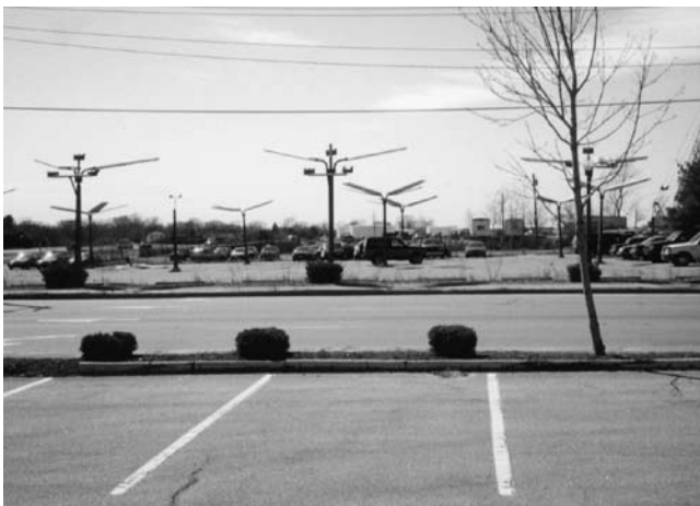
Natural forms are preferable to overpruned plants. Plant material should be selected with consideration for ultimate size to avoid unnecessary pruning.