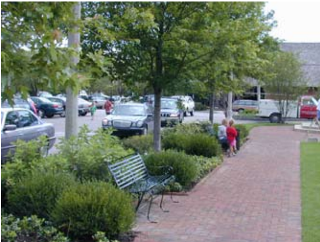
A pedestrian use area has been effectively separated from the adjacent roadway by a backdrop of flowering shrubs, perennials, and trees.