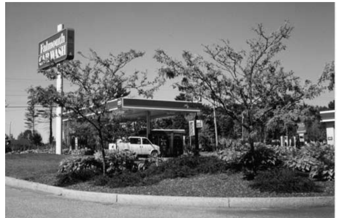
Trees, evergreens, shrubs, and perennials should be able to withstand severe growing conditions and weather. This informal grouping provides an attractive accent for a highly visible corner.

Safety. Plant material should be selected with due consideration to public health and safety. Avoid plants with poisonous or messy fruits or leaves, large thorns, or overly aggressive growth patterns. Large shrubs which could provide hiding places along pathways or block the view of moving vehicles should be avoided.