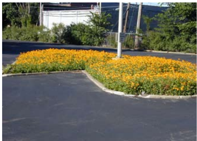
This island of hardy black-eyed susans adds texture and a spot of color to the parking lot.