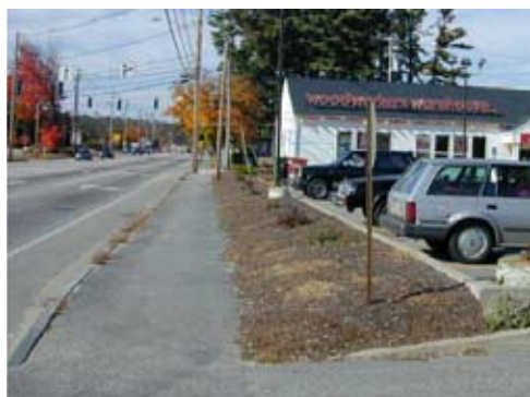
A less-than-effective roadside planting scheme.

Planting Design. Planting design should stress simplicity in form and limit the number of species used. Plants should be massed to soften edges, corners, and paved areas and to integrate the building into the landscape.