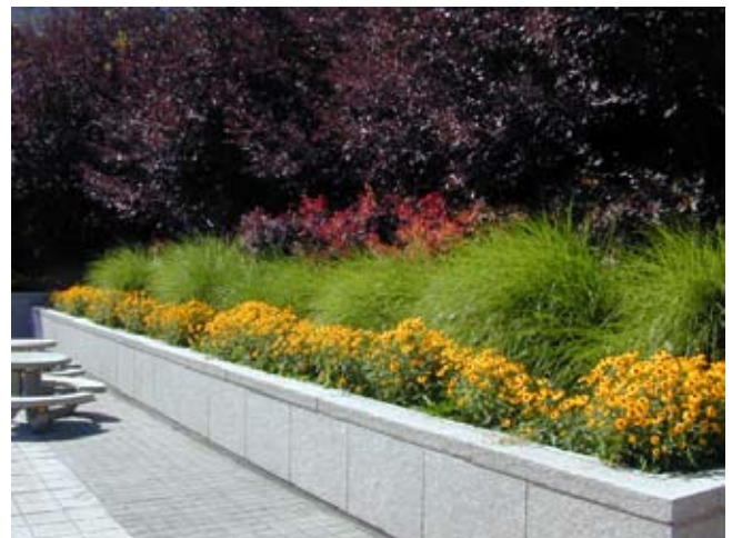
Ornamental grasses can provide a simple, cost-effective, low-maintenance way to add texture throughout the year.