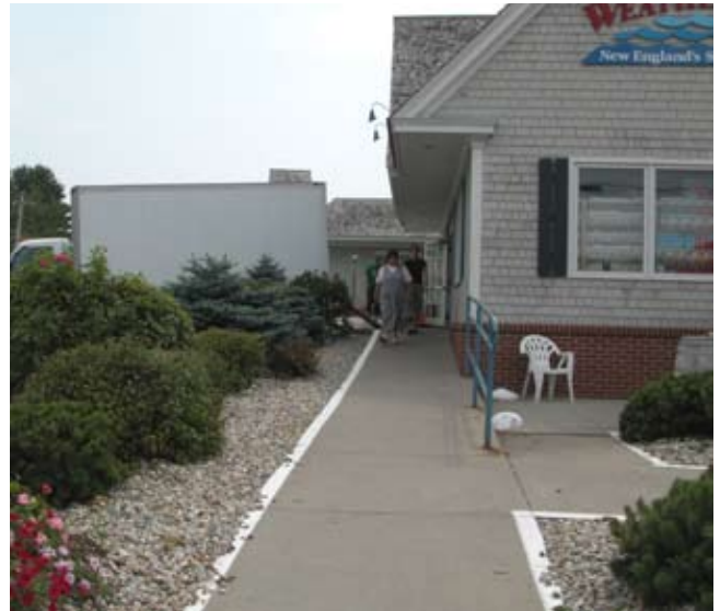
This round rock mulch may be an effective ground cover, but it can present a safety hazard when loose rocks end up in the walkway.

Approach. The use of integrated pest management, organic lawn care, and other environmentally sustainable practices is strongly encouraged.