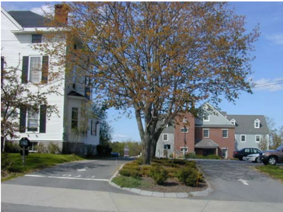
This line of maple trees were identified early in the planning process as a feature to be preserved. The driveway design was adjusted to minimize damage to the root systems.

Replacements. Where trees noted to be saved are damaged or lost during construction, the Planning Board or CEO may engage the services of a licensed arborist to determine the value of the trees and to develop a mechanism for their replacement.