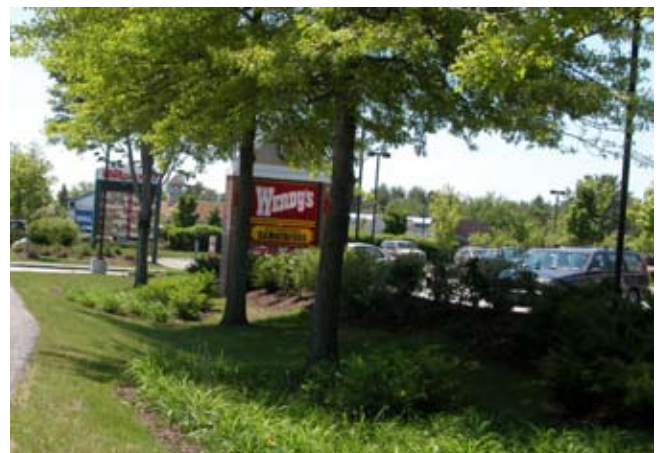
A boulevard effect is envisioned for Raymond's highways.