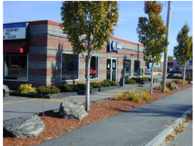
If large rocks are used in the landscape, they should be buried so at least 1/3 of their mass is below ground, and not simply placed on the surface.

American Standard for Nursery Stock: ANSI Z60.1-1996. American Association of Nurserymen. 1997.