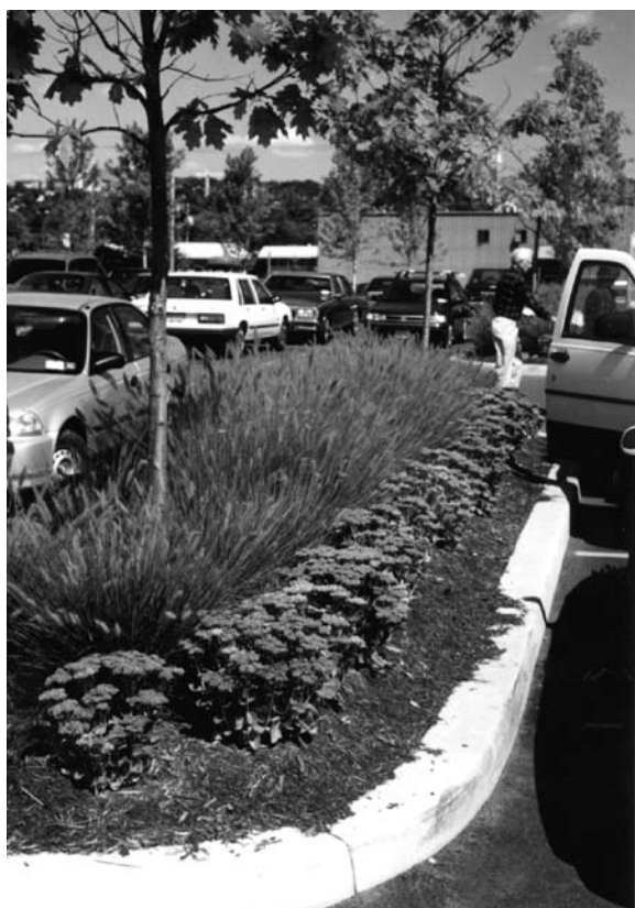
Parking lot islands provide an opportunity to use a variety of plant species to break up the mass of pavement and introduce interesting textures.