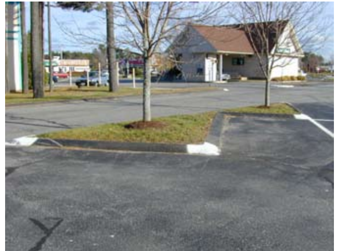
Trees can be planted throughout parking lots as long as they are given enough room for proper root development and protection from cars and snowplows.

Snow Storage. Landscape materials surrounding parking lots and in islands should be able to tolerate large quantities of snow stored during winter months. Delicate plant material should not be used in areas where they are likely to be buried under snow.