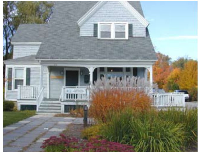
A simple planting plan that feature drifts of perennials and ornamental grasses to accentuate a small medical building.