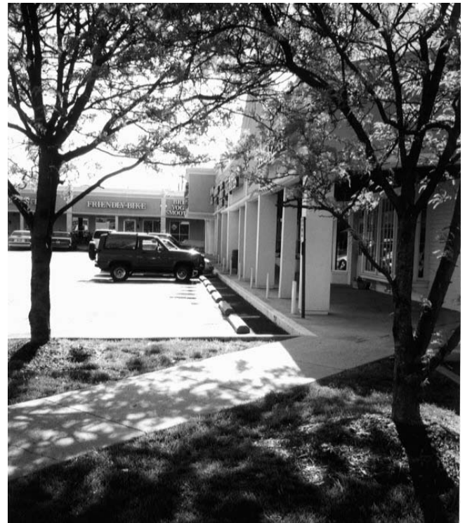
With proper planning, trees, shrubs, and other plantings can provide shade, emphasize entrances, screen undesirable views, and add color and interest throughout the year.