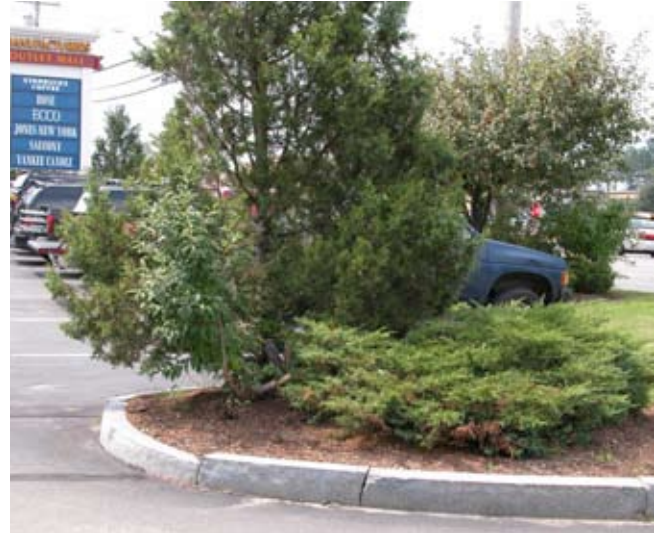
The ultimate height and density of these plantings were not considered in the planting plan, resulting in a potentially dangerous blind spot for someone backing out of this parking space.