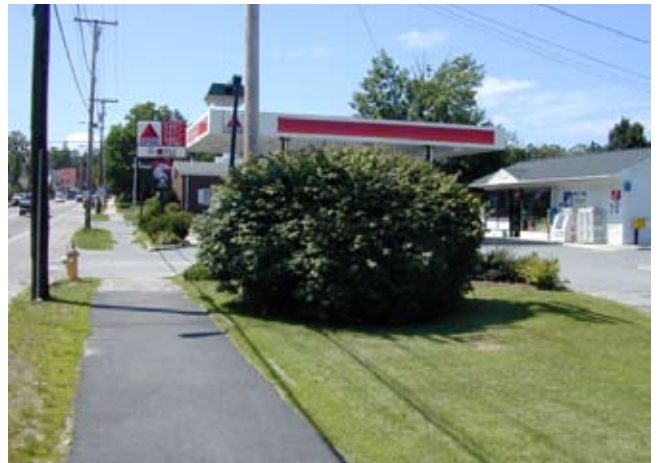
This full-grown euonymus blocks the view of motorists leaving this service station. A smaller shrubs, requiring less maintenance, would have been more appropriate.