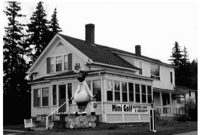
A humorous, but exaggerated advertising feature which could distract motorists and contribute to a sense of clutter along Raymond's highways.