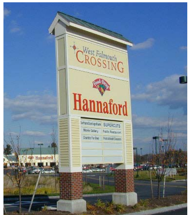
This sign establishes a hierarchy on the sign and features detailing found on the building.