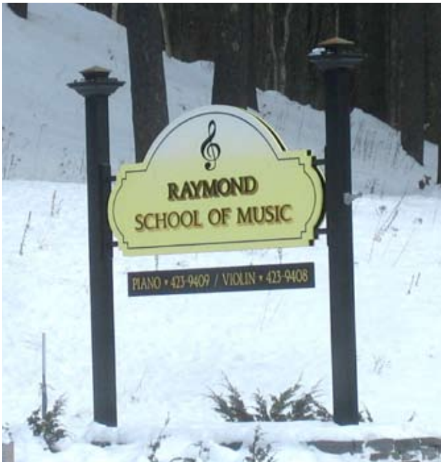
This simple, straightforward sign uses 20 letters and a logo to announce the location of the music school.