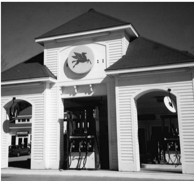
This discrete facade-mounted sign is well-integrated into the building and the area.

Time and Temperature Signs. Time and temperature signs (TTS's) are allowed to be part of a commercial sign in accordance with the Raymond Land Use Ordinance. TTS's shall not exceed 10 SF in area, nor be located >10 feet above grade. No TTS should be installed within 2,500 feet of another TTS. The sign shall not change more than once every minute.