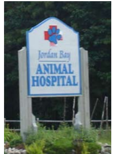
(Right). This animal hospital sign uses a minimum number of letters and a logo to convey an effective message.