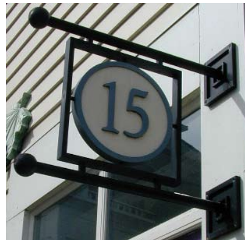
Mounting hardware can emphasize a sign and greatly enhance the building's appearance.