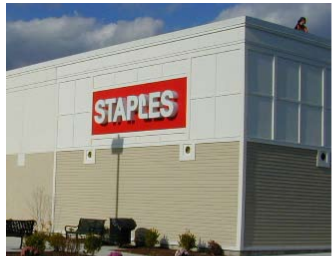
This sign is well integrated into the design of the side facade, displaying only the essential information.