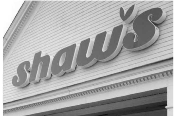
An effective use of individual internally-lit letters to create a simple identity for a commercial building.

Maintenance. Signs should be located where they can be easily maintained. Non-functioning bulbs should be replaced immediately.