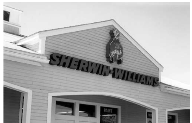
Internally-lit letters and logos are preferred over whole panels. The sign is scaled to the architectural elements that surrounds it.