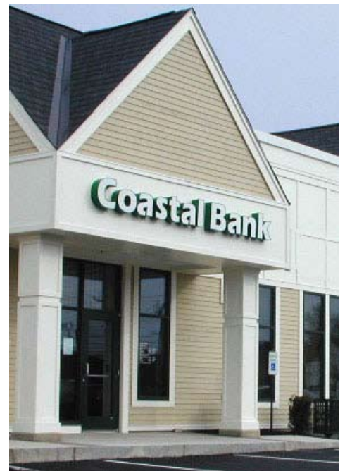
Signage in a multi-tenant development that has been effectively coordinated by mounting locations, graphic design, detailing, and character. Sign content is limited to the name and logo for each commercial use.