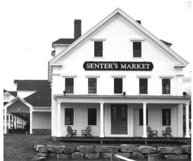
A simple sign for a commercial use that complements the historic structure by attention to scale and design.

Projecting Signs. The use of signs that project from the face of the buildings is encouraged, especially where buildings are located at or near the Route 302 walkway. Projecting signs should be designed to complement the design of the building by virtue of their forms, color, and scale. Signs should be positioned so they do not block the view of signs on adjacent buildings. Signs should be mounted so the bottom of the sign is a minimum of 8 feet above the grade.