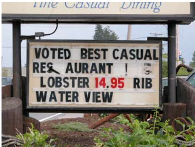
Readerboards – spaces on signs designed for changeable messages – should not have more than 4 lines of text.