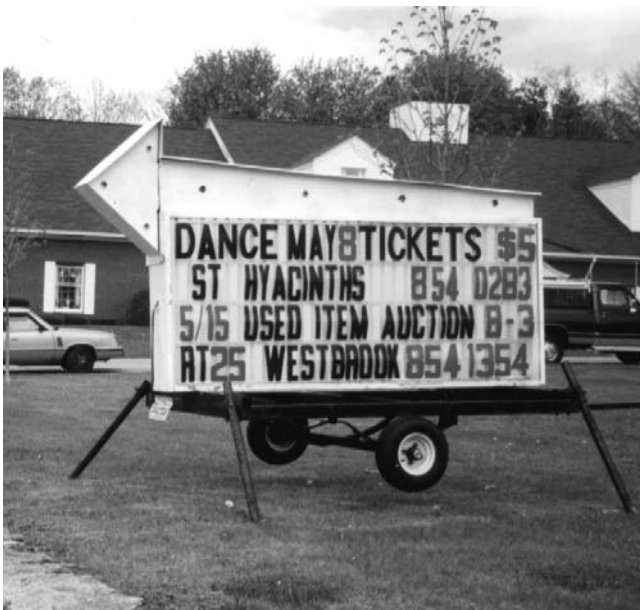
Temporary signs should be designed to relate to the surrounding buildings. This sign adds visual clutter and does not relate to the nearby commercial area.