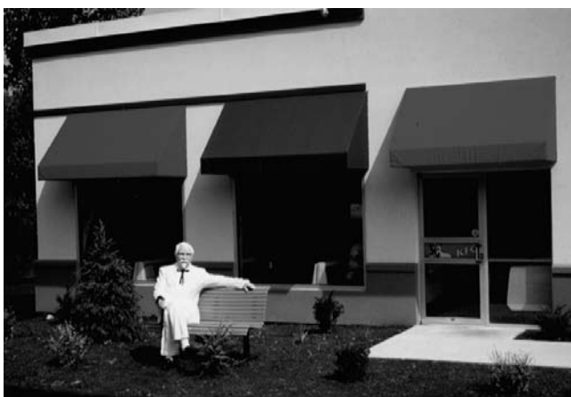
Life-size figures and similar advertising features that are being used in national franchise developments are inappropriate because they can detract from Raymond's sense of identity and uniqueness.