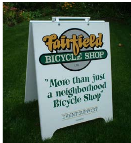
An example of a sandwich board that meets the design guidelines.

Sandwich boards. One temporary sandwich board is permitted for each business provided that it meets the ordinance provisions for permanent signage in relation to its design and lettering. Sandwich boards shall not exceed 3’ in height and a total of 9 SF per side in size. Sandwich boards are allowed to be displayed outside only during the hours of operation of the business. Sandwich boards are not subject to lot line setbacks, and may be placed in the portion of a public right of way abutting the property containing the business as long as they are not placed in a travel way or on a public sidewalk and do not create a hazard.