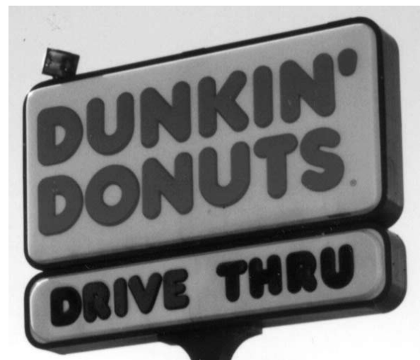
This message of the sign should be translucent, and not the white background as in this example.