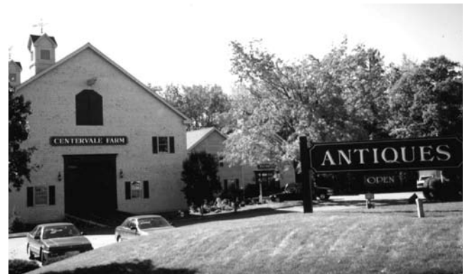
Good examples of well-designed, well-crafted signs that convey a strong message with minimal content.