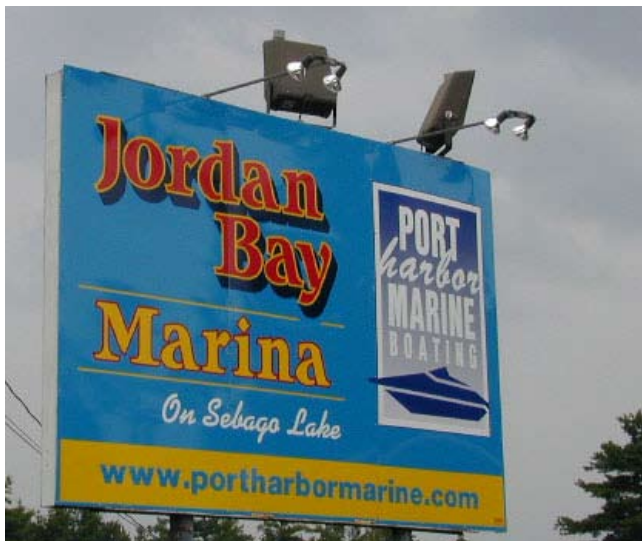
These top-mounted light fixtures are not well shielded nor integrated into the sign.