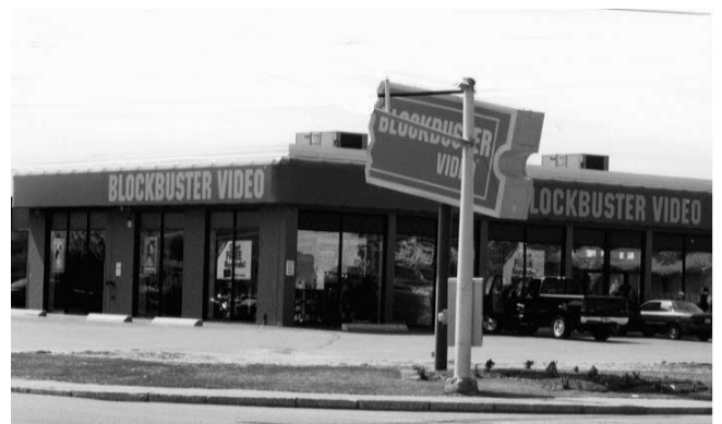
Advertising features, such as this overscaled ticket and internally lit band of color behind the facade sign, may be unnecessarily distracting and contribute to clutter.