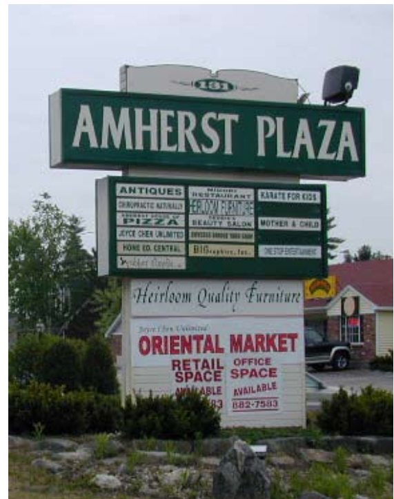
Information overload contributes to roadside clutter and diminishes the effectiveness of individual signs.

Readerboards. Readerboards attached to permanent signage noting the site or specific business are permitted and will be included in the calculation for permitted sign area. The readerboard should be fully integrated into the overall sign design by virtue of its form, scale, color, and detailing. The Raymond ordinances require that readerboards shall not occupy more than 50% of the area of a sign. Readerboards shall contain no more than four lines of text. Lettering height shall be less than 6”.