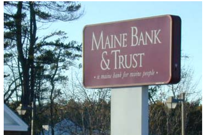
The sign's dark background and light lettering emphasize the bank's name while minimizing glare.