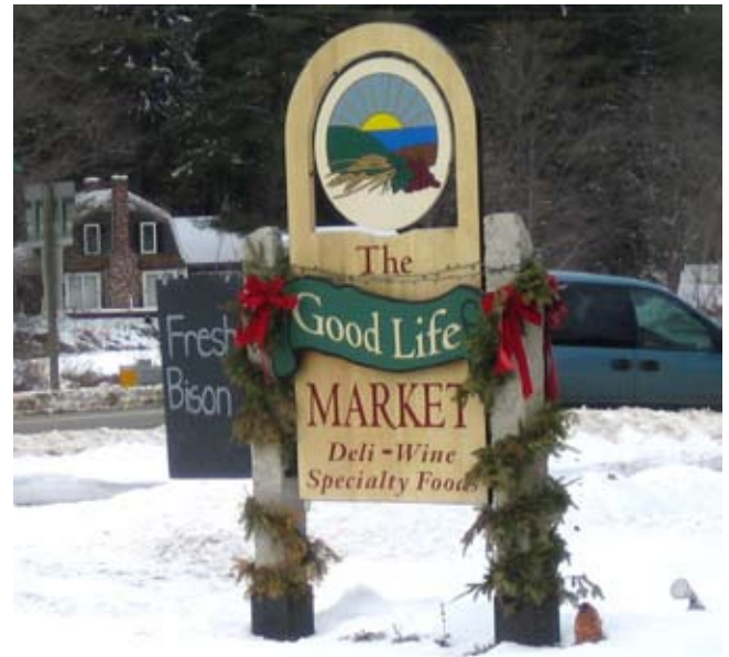
(Above). An attractive, legible sign using traditional granite posts for supports. A temporary sign announces the day's specials.