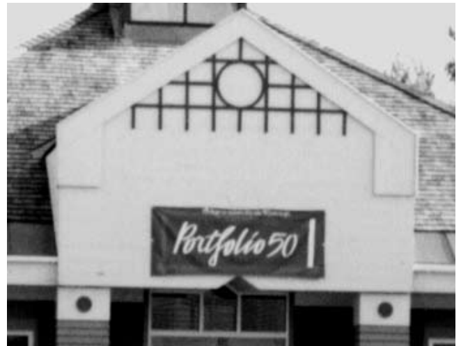
This well placed temporary sign does not exceed 20% of the total signage area.

Review. Permanent advertising features are discouraged. Advertising features that are designed as permanent parts of the site plan should be presented to the Town as part of Site Plan Approval. The Planning Board may request rendered illustrations to evaluate the effect that any proposed advertising features may have on the public landscape.