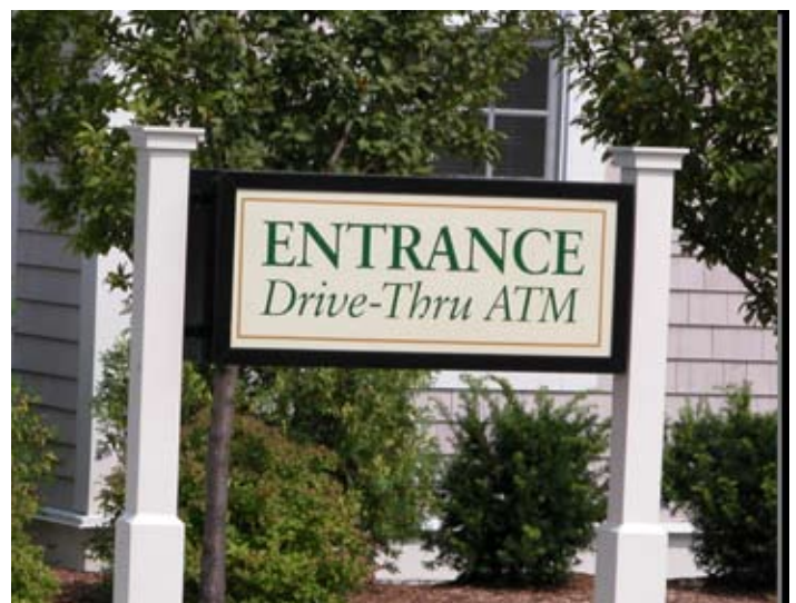
These two signs are part of a coordinated signage system for a new branch bank. Signs are unified by repetition of colors, typefaces, and mounting systems.