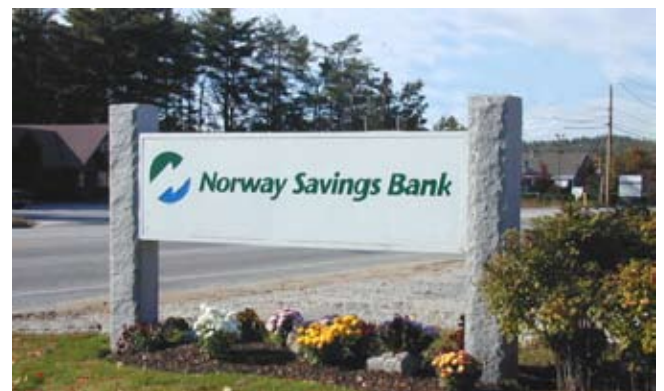
A highly legible identity sign characterized by simplicity in materials, form, and lettering that makes a positive contribution to a commercial corridor.