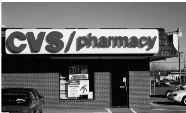
This overscaled sign acts as a light fixture, contributing to skyglow.