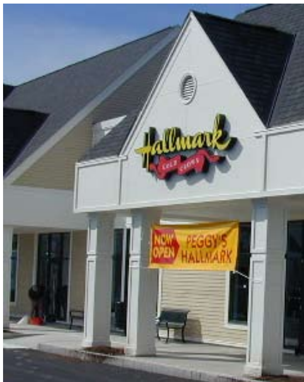
A colorful temporary sign announcing a grand opening.

Temporary Advertising Features include, but are not limited to greater-than-life size models of food or other products, replicas of spokespeople associated with commercial products, rows of flags or banners, and balloons and inflatables.