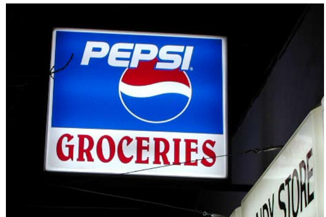
A sign where the sponsor's message covers 75% of the sign area.