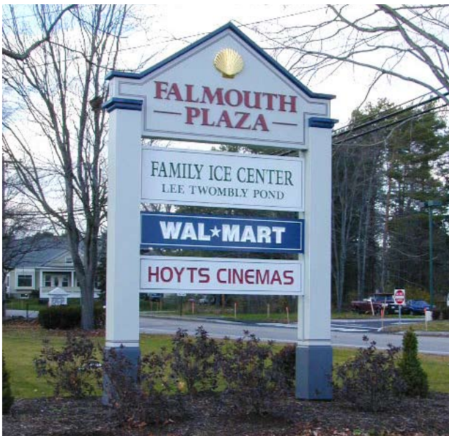
A multi-tenant sign with a clear hierarchy of information. The name of the plaza is at the top in bolder lettering. Individual tenants are listed on contrasting backgrounds.

Colors. The use of a limited number of colors on all signage is strongly recommended. Colors should be selected to complement or match the color on the main building.