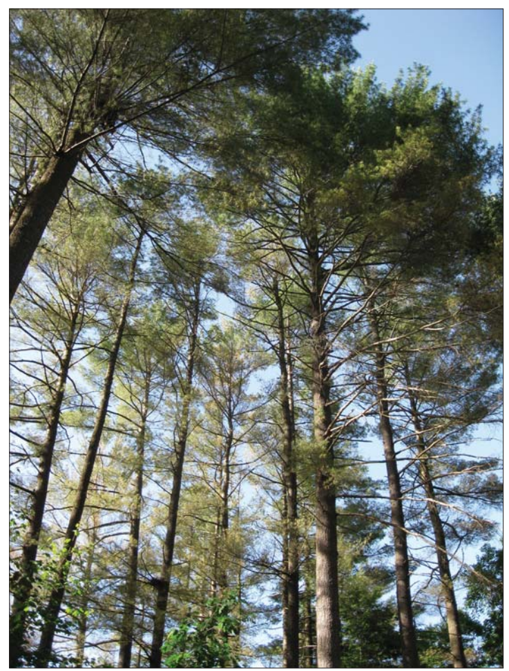
Figure 4. Damaged eastern white pines with thinning crowns.