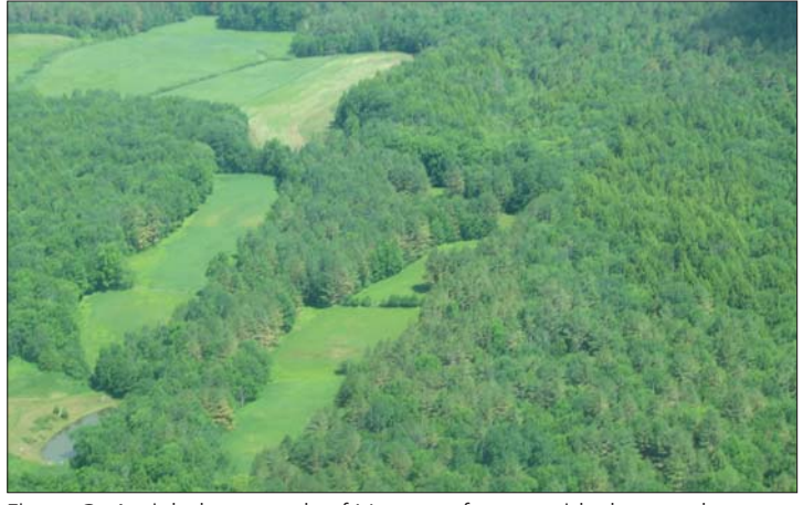
Figure 3. Aerial photograph of Vermont forests with damaged eastern white pines.