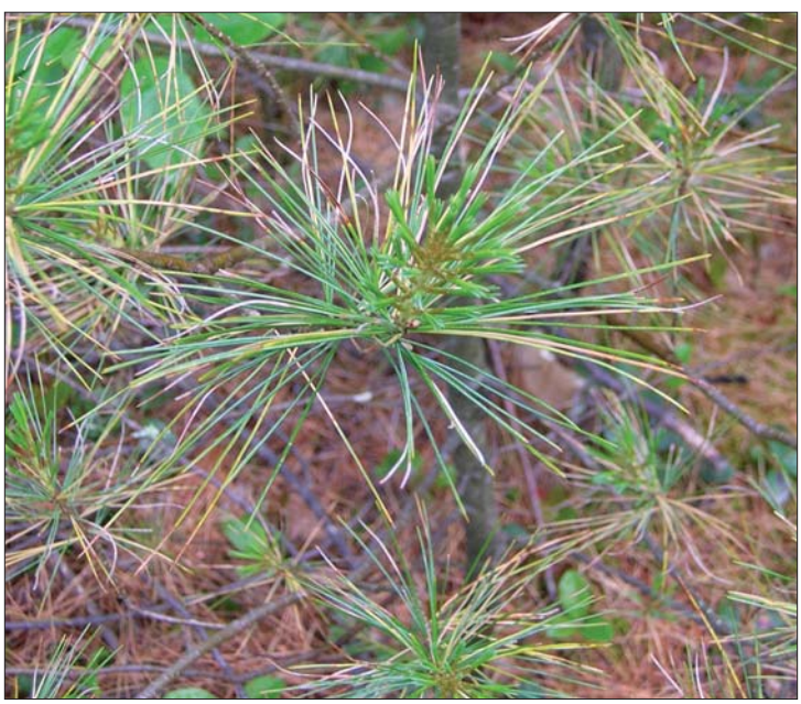
Figure 2. One-year-old needles with damaged tips on eastern white pine regeneration.