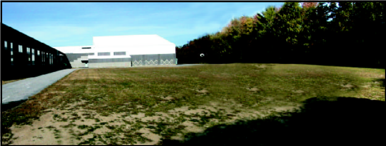
The bleak Jordan-Small Middle School recreation area as it is today.