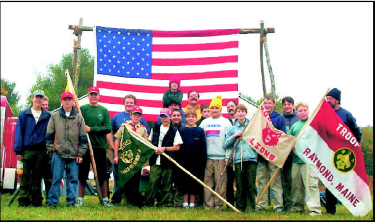
Troop 800 at the October Camporee in Scarborough