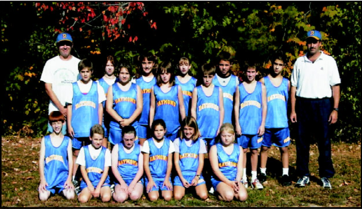
2001 Jordan-Small Middle School Cross-Country Teams