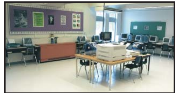
Four special project computers, capable of digital movie editing, photo editing and music creation.

State of the art iMac and Mac G4 computers running both Mac and Windows operating systems are available for classroom instruction. Our technology philosophy is to use computer software and internet information resources to enhance classroom instruction. Computer technology is no longer treated as another subject taught and isolated