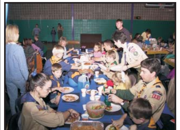
Everyone digs in at the Blue & Gold Banquet