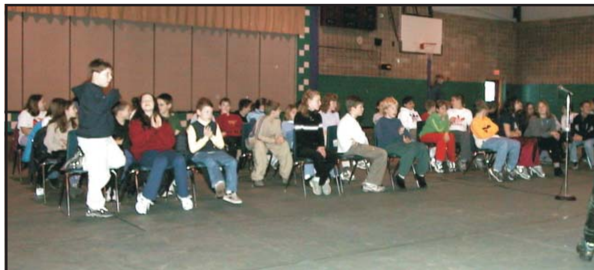
Spelling Bee competition in the JSMS gym.