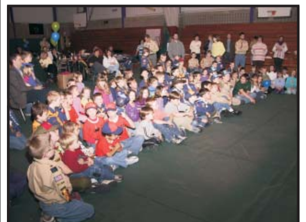
Cub Scouts are enchanted by a magician

have her favorite which they would climb over and over. Many girls were extremely agile and could reach the top of the 20' wall with no difficulty. As the day went on, the girls became more trustworthy of the adults belaying them; they gained individual confidence, and were very supportive and encouraging of one another. Each girl left with a smile on her face and a story to take home.