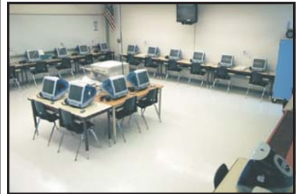
20 new computers, many with writeable CD drives and few with DVD capability.

from core subjects, but treated as an educational tool. We are very excited to add this resource to the existing computer lab in the Media/Library Center and the many computers in the classroom.