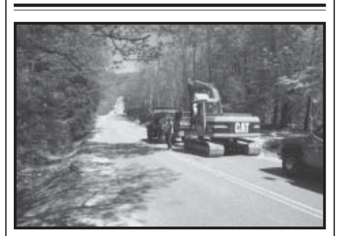
The Public Works Department has been busy with maintenance work projects on Raymond Hill Road and Spiller Hill Road.